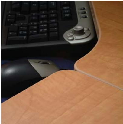
Ergonomic radiused corner detail throughout series.

The 318 Series is especially popular in educational and medical administration offices, but works well in virtually any fast-paced or high traffic office environment. Top and Gable components are all 1" thick, thermally fused laminate with a tough 3 mil PVC matching edge, to resist impact damage. The radiused corner detail not only softens the "look" but adds a practical flair by eliminating sharp, 90 degree corners. With Heartwood's excellent reputation for customizing standard components, you'll not only have furniture that will look great for years, we'll help you create a practical solution that fits your work area perfectly. Now, that's Heartwood!