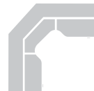
Neo Angle - Reception Layout with Outlines Series Panels Shown in: Evening Zen Base with Hardrock Maple Top 95" x 95"