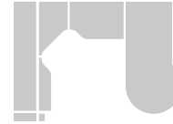
Layout #14 Shown in: Grey Dusk & Pure White 106.5" x 112.5"