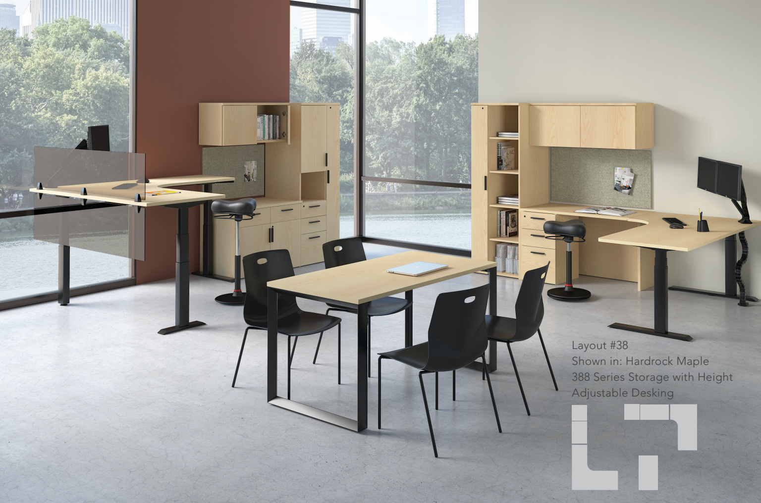
Layout #38 Shown in: Hardrock Maple 388 Series Storage with Height Adjustable Desking