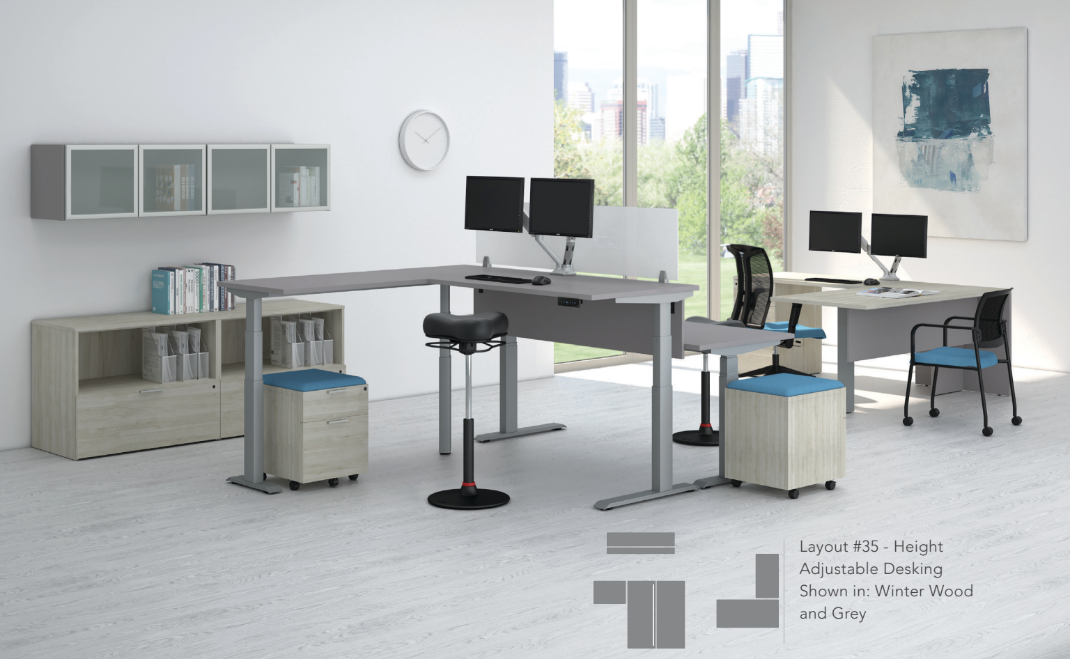
Layout #35 - Height Adjustable Desking Shown in: Winter Wood and Grey