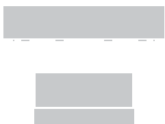
Reception Layout #21 Shown in: Driftwood Grey Storage: 23.75" x 118.5" Desk: 38.25" x 73"