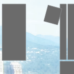
Layout #36 Shown in: Winter Wood 71" x 88.75"