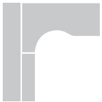
Layout #13 Shown in: Hardrock Maple 71" x 71"

The 388 Series blends form and function beautifully with high quality materials and workmanship to create the perfect work environment. Contemporary styling and a long history of creating unique spaces with custom designed components as well as seamless integration with other series components if desired, are all hallmarks of our highly functional 388 Series . Organize your office in style with a wide choice of storage options to make your space your own. With an eye on tomorrow, 388 is the ideal solution for today's busy office.