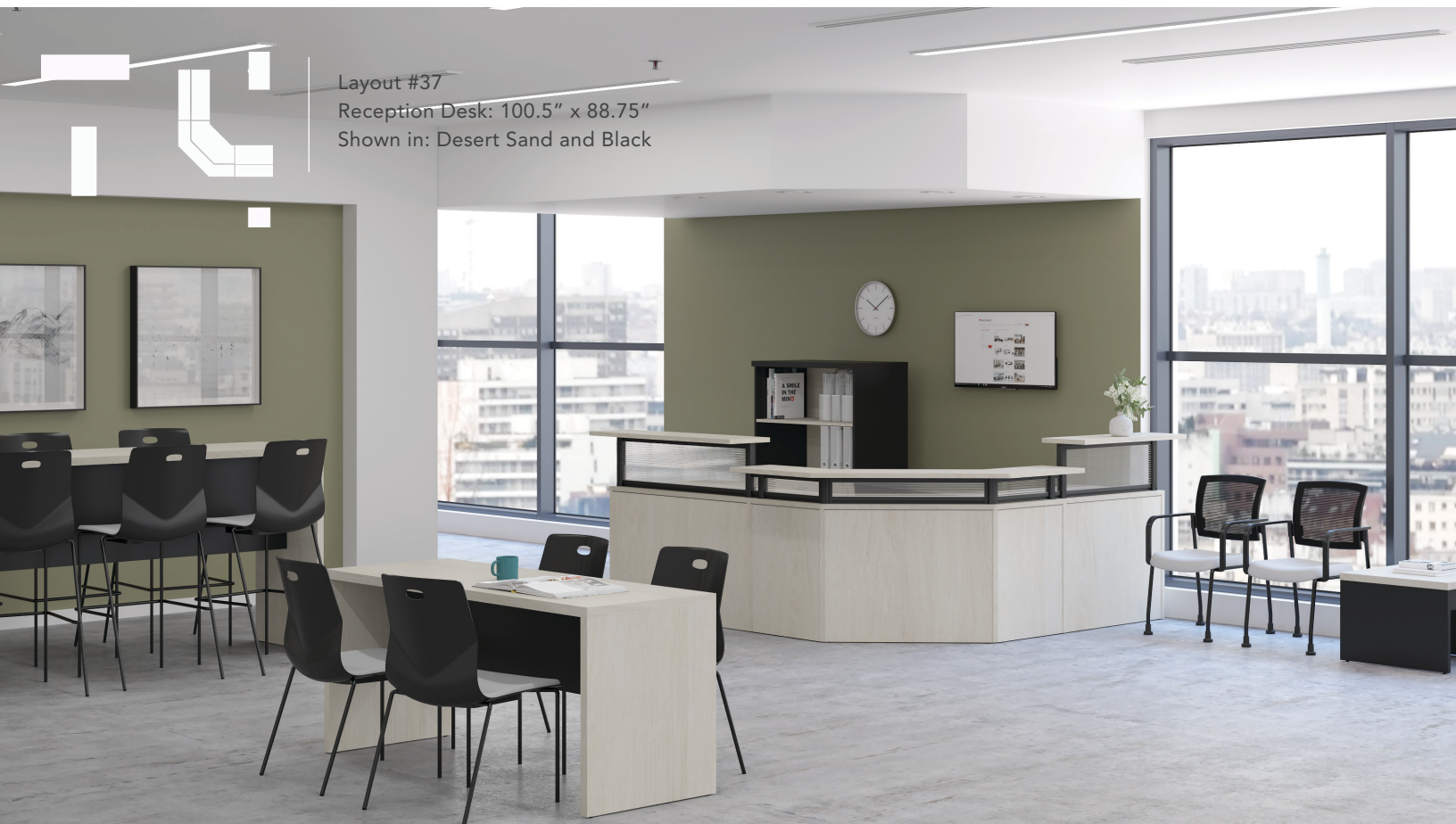
Layout #37 Reception Desk: 100.5" x 88.75" Shown in: Desert Sand and Black