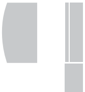
Layout #11 Shown in: Black Walnut Desk: 41.5" x 71" Hutch Unit: 19.75" x 106.5"