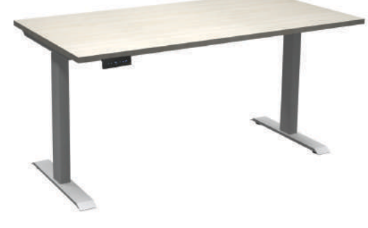
Extended Height Range: 27.5"- 45.5" (does not include top)